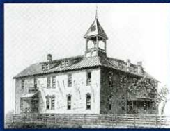
Trinity School, a school for freedmen, established 1865

Two of Alabama's oldest towns, Athens and Mooresville, are located here. Fine homes, built of native materials, abound throughout the county.